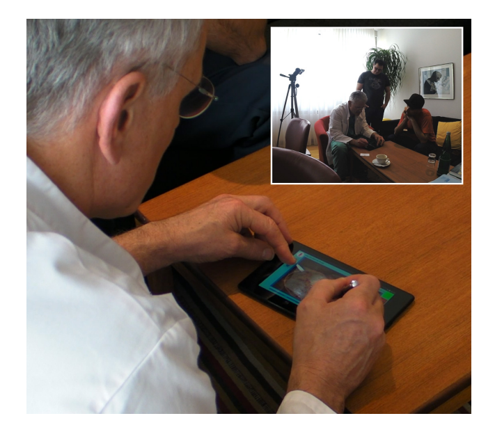
Figure 1: Experimental setup of the thinking aloud test.

Media Performance Group Simula Research Laboratory AS Norway